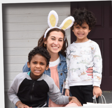
Early Learning Center